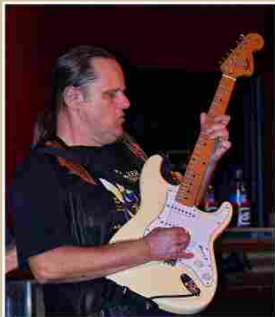
"Walter Trout"