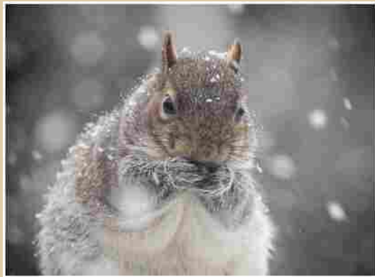
"Grey Squirrel in the snow"