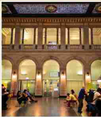
"Post Office" by Ian McDiarmid