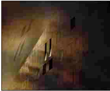
"Gold Lights In The City" by Lyn Newton